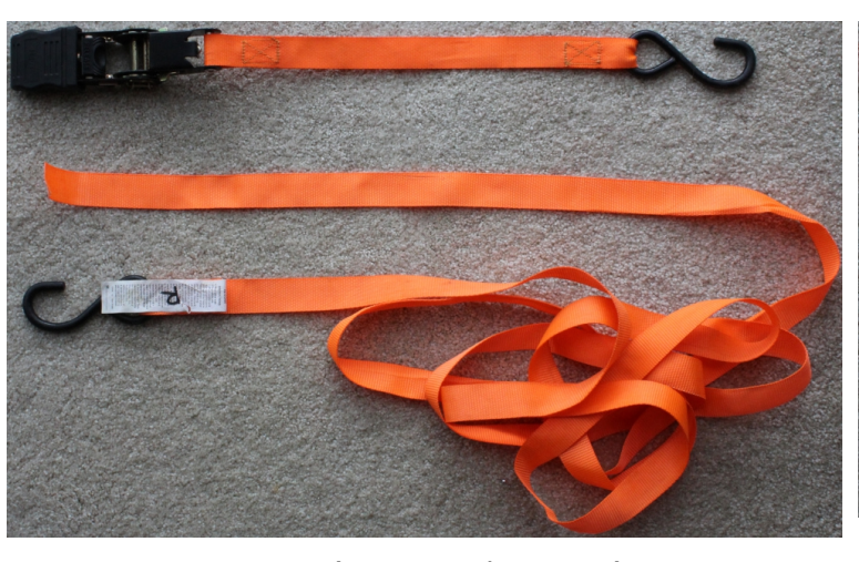
Seq. 1 (Separated at start)