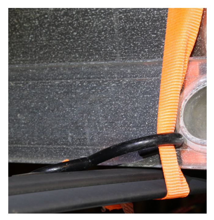
Wrap & tack long strap by hook