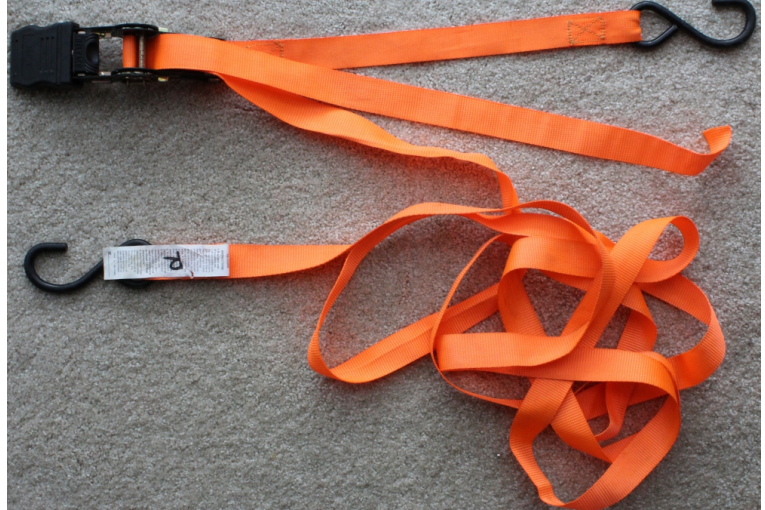
Seq. 4 (Open ratchet; Pull strap to adjust strap length) Strap Binding