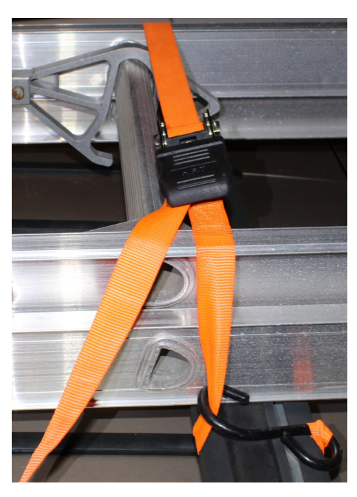
Wrap & tack short ratchet strap by hook