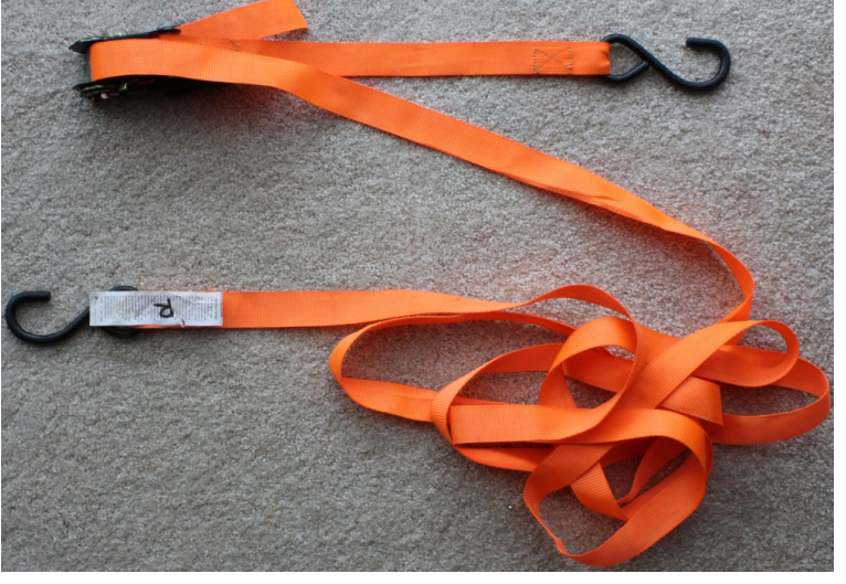
Seq. 3 (Close ratchet)