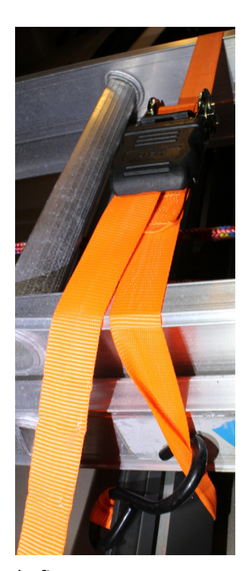
Rewind strap and close latch to securely fix